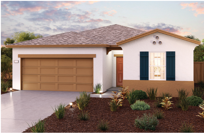
ELEVATION A - EARLY CALIFORNIA

APPROX. 1,509 SQ. FT. | 1-STORY | 3 BEDROOMS | 2 BATHROOMS | 2-BAY GARAGE