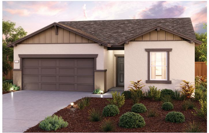
ELEVATION B - BUNGALOW