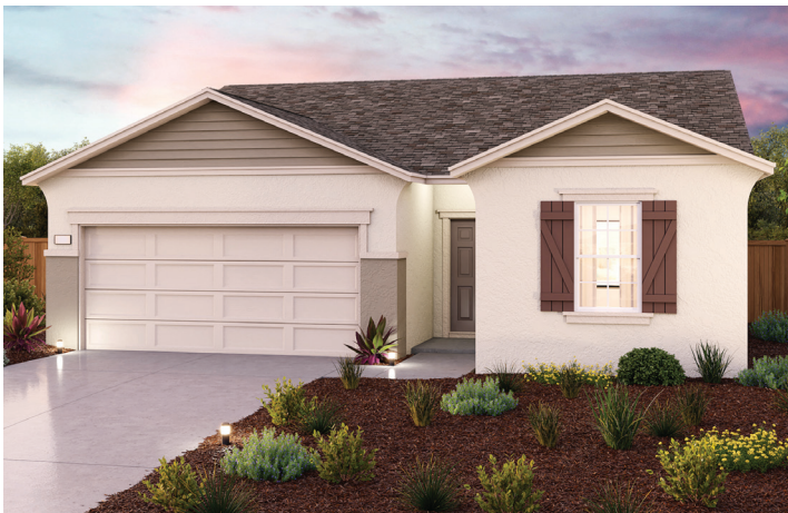
ELEVATION C - COTTAGE