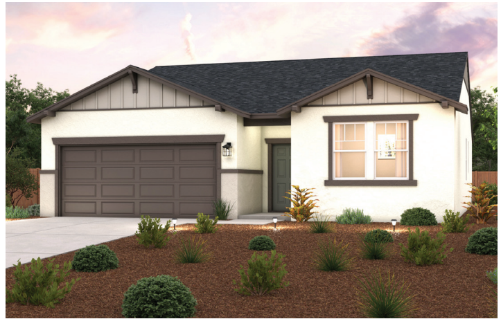
ELEVATION B - BUNGALOW