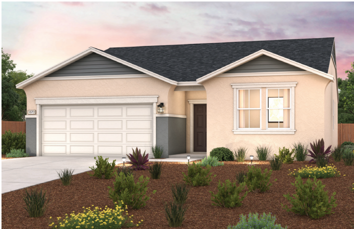
ELEVATION C - COTTAGE