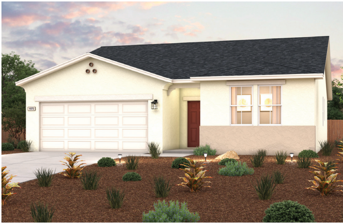
ELEVATION A - EARLY CALIFORNIA

APPROX. 1,572 SQ. FT. | 1-STORY | 3 BEDROOMS | 2 BATHROOMS | 2-BAY GARAGE