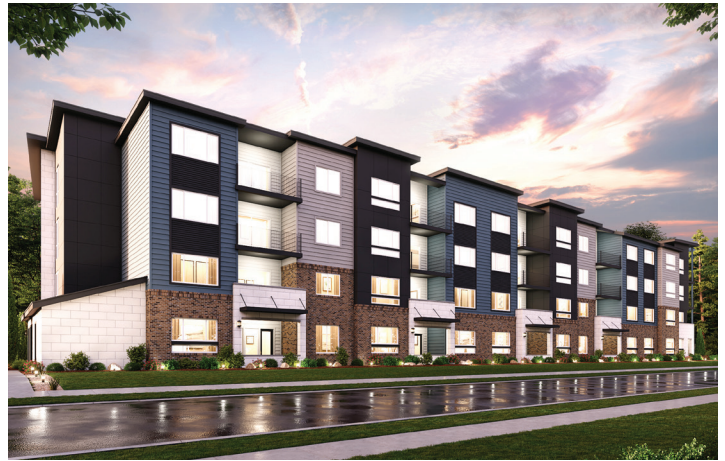
BUILDING 2 ELEVATION