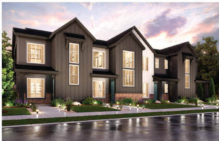
ELEVATION A - 4 PLEX

APPROX. 1,319 SQ. FT. | 2-STORY | 3 BEDROOMS | 2.5 BATHROOMS | 2-BAY GARAGE