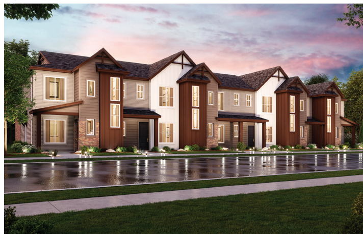
ELEVATION B - 6 PLEX