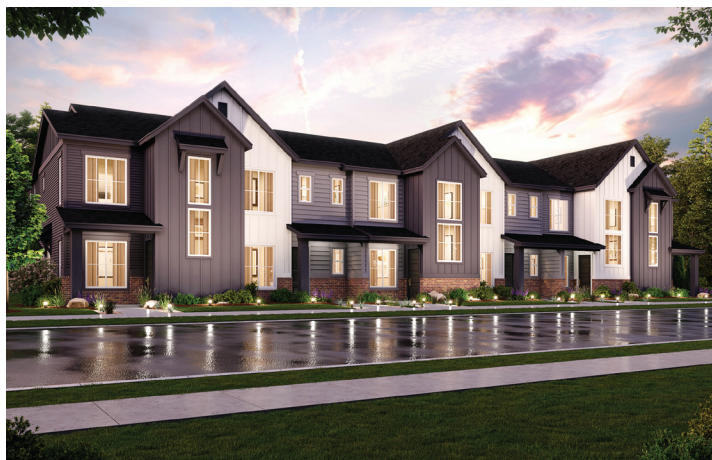
ELEVATION A - 6 PLEX