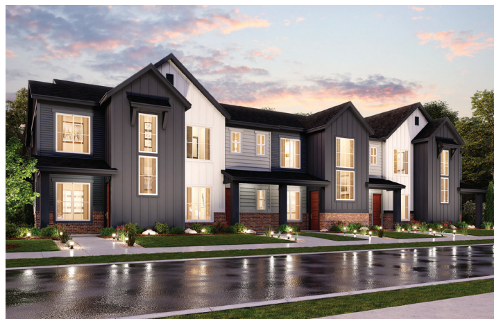
ELEVATION A - 5 PLEX